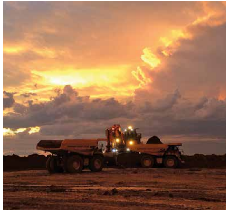
Land of the Living Skies

Names of employees with correct answers will be entered in a draw for a $25 gift card as well as Bypass bragging rights. The winner will be announced in the next issue.